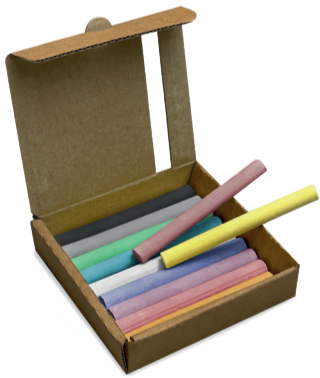
Colori Assortiti - 18pcs MHC 110