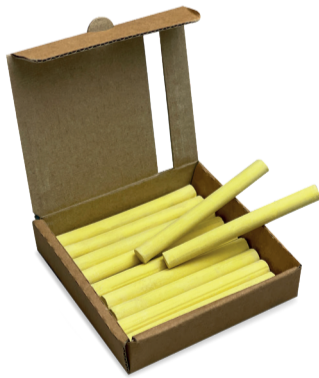
Colori Monocromatici - 18 pcs MHC 112